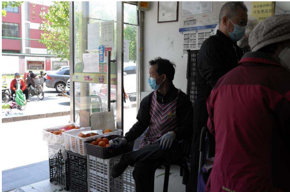
Figure 9 Entrance of a supermarket

Woman: I don't know what to say, you can go over there and ask the manager.