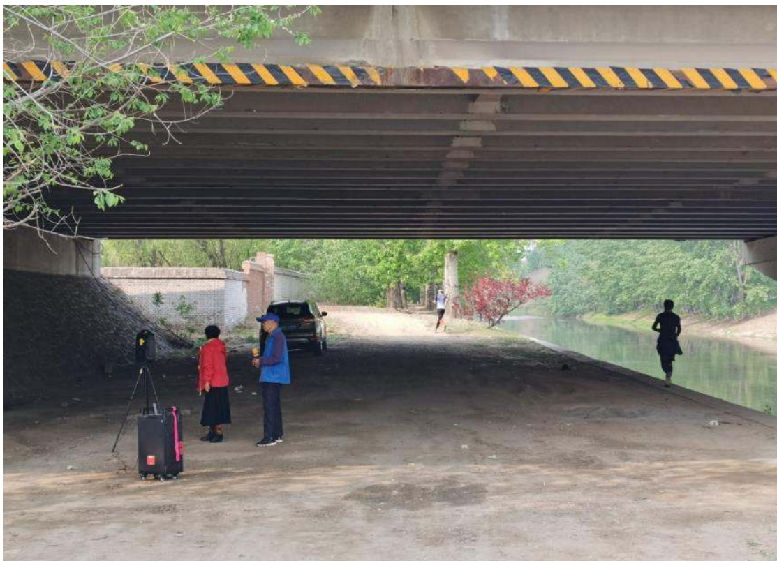
There are some activities happening under the highway bridge. Most activities are individually conducted outside such as jogging. Even some activities that usually take place inside, like the couple singing Karaoke with their portable devices.