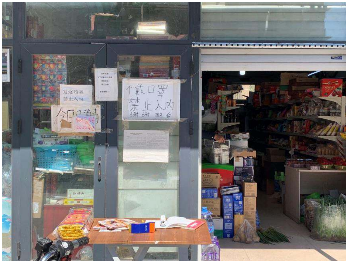
Figure 8 Entrance of a grocery store

Show the photo Entrance of a grocery store and Entrance of a supermarket