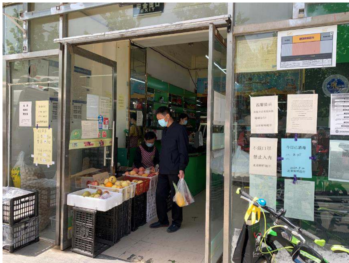
Figure 7 site of interview 3