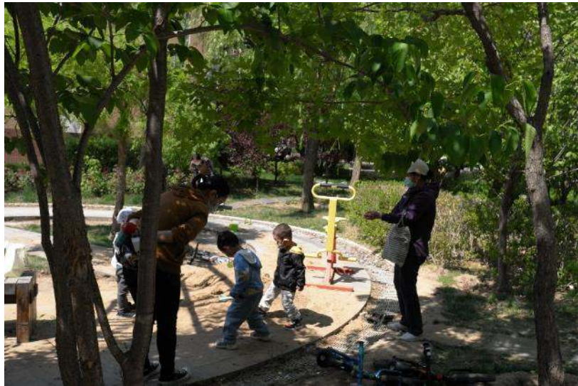
Figure 5 Kids in community

Jingfan: Is there always so many kids playing here?