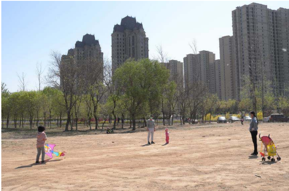
A family of four in a wild field.