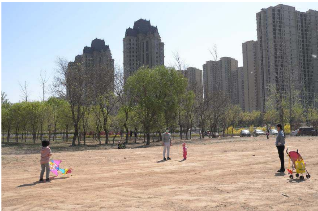
Figure 6 Family in a wild field

Show the photo of Family in a wild field